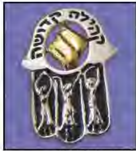
Pin Design by Eytan Brandes