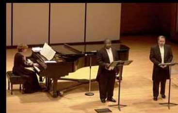
Dr. Martin Luther King, Jr. Commemorative Concert, Saginaw, MI