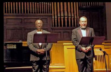
Performing at the Sixteenth Street Baptist Church in Birmingham, AL

Sunday, March 11, 2012 at 2:30pm Brock Recital Hall Samford University 800 Lakeshore Dr., Birmingham, AL, 35229 (205) 726-2778 www.samford.edu/arts/tickets