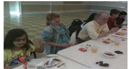
Religious School Tu B'Shevat