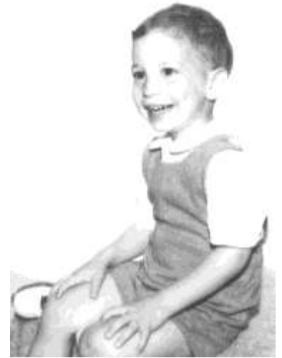
Guess who I am!

or order online at https://www.templebeth-el.net/perfectsense/